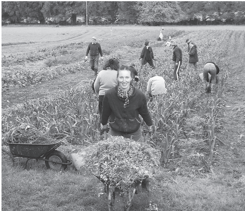
Pitching in on the SCA fields.

On the web: www.stroudcommunityagriculture.org