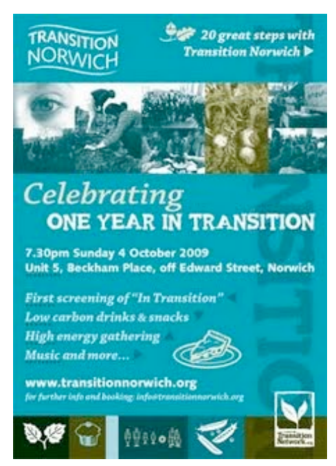
Party Poster! One year of Transition Norwich (Oct. '09)

numbers six people. Outwardly TN is actively engaged with other groups to bring about sustainable change. They are looking at government plans for the region, supporting the sustainable initiatives and challenging the pressure for more roads, houses etc. as well as supporting national campaigns for climate action. Their main in-house focus has shifted towards building up the Resilience Plan (formerly known as the Energy Descent Action Plan!), while the theme groups, ranging from Heart and Soul to Transport to Textiles, having undergone many changes, are now concentrating their efforts on working with this plan. The other two drivers are the Transition Circles and the Communications group which organises events, outside communications, press and publicity and the website (with two blogs) and a monthly bulletin.