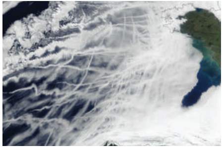
The thin white lines show how aerosols from ship exhausts brighten clouds over the Atlantic Ocean.

Scientists have yet to untangle the interplay between pollution, clouds, precipitation and temperature. However, NASA's Glory satellite, an aerosol and solar-irradiance monitoring mission scheduled for launch in October, will