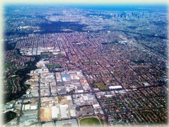
Urban Sprawl- the challenge to make it clusters of Sustainable Towns

Our next meeting is on Monday 13 th February at Waimea Primary School from 07:00 to 9:00 Primary School in Sandy Bay. Do join us. It makes a world of difference locally.