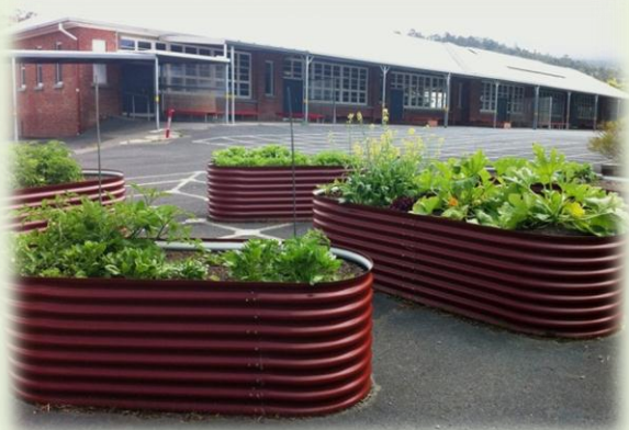
Fun with Food at Waimea Primary School

If you are interested in joining one or more of these groups please do so at our meeting on 13 th February.